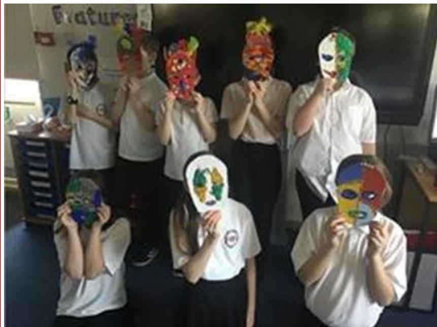
Masks made in class

Year 6 have been learning all about the flamboyancy of carnivals in Brazil and really embraced their learning tasks when it came to making masks and head pieces. In school, the paint, glue and glitter was released and the children had an amazing time creating their own masks. At home the children have also been busy creating some amazing examples of work which they have photographed and sent in.